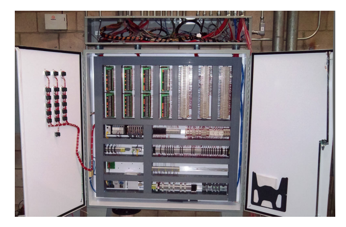
The OptoEMU Sensor and other SNAP PAC System hardware is wired to SUPERVALU's refrigeration system components and gathers consumption data. This data is then made available to both the company and curtailment service provider Net Peak.

programmed to send alerts if these ever deviate from a predefined range. This ensures that food is always stored and preserved properly and no spoilage occurs.