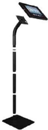
Hoffman iPad stand

phone, or iPod used as an HMI on machines, kiosks, or walls, where many people touch it. 11