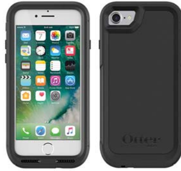
OtterBox Pursuit series

Other solutions include low-cost field protection against water, dirt, and shock from LifeProof™, and iPad stands and enclosures from Hoffman®. 13