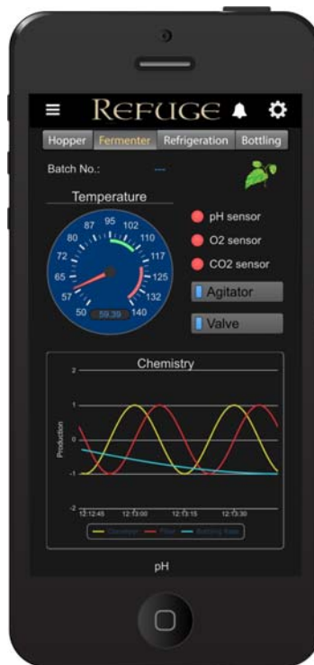
groov View HMI