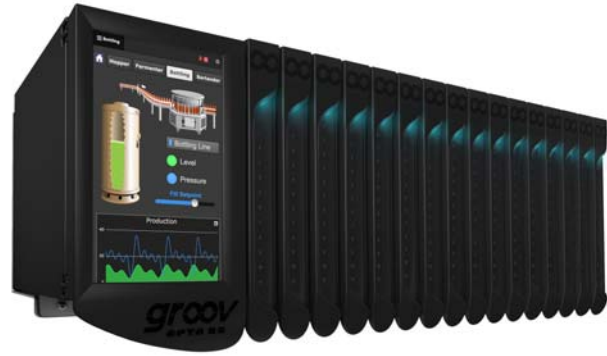
groov EPIC edge programmable industrial controller includes an HMI viewable locally and on mobile devices.

Whenever you connect to a private company network over the internet, most security experts recommend using a virtual private network, or VPN. The VPN creates a kind of protected tunnel through the internet for increased security. COTS mobile devices have a VPN client built in, which simplifies setup for a VPN.