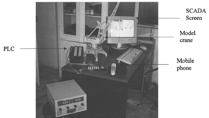
Early experiment using mobile in automation 7

Mobile adoption in automation has been slower than in other fields, though enthusiasm began early. In 2004, two researchers from Turkey theorized that mobility could make workers in industry more productive. Their proof of concept? They used a mobile phone to control a model crane using a SCADA system. 7