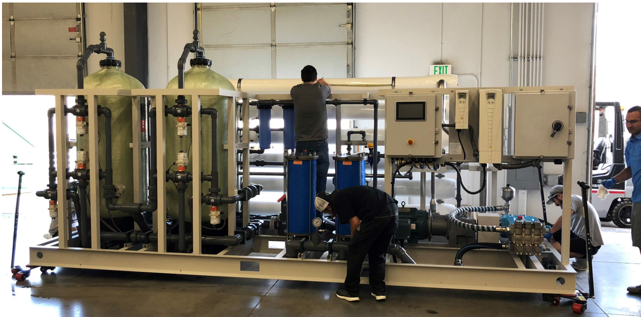
Building a Titan system in the FCI Watermakers factory

One of FCI's customers introduced them to Opto 22's groov View, a browser-based software tool for building an operator interface to systems and equipment. The interface can be viewed on mobile devices as well as computers—anything with a web browser, from a smartphone to a web-enabled HDTV.