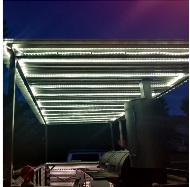
Behind the custom barbeque, you can just spot the NEMA 4X enclosure that holds the groov RIO.

It was also important to Dave's customer to be able to access the smoker controls on his phone, so he didn't have to drag a computer around. Dave connected a USB WiFi adapter to the groov RIO module, installed an industrial-grade access point in the trailer, and built a GUI in Node-RED.